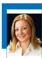
B K Saracoglu Baskent University Istanbul, Turkey