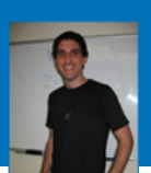
H Binyamin Perets Institute for Theory and Computation Cambridge