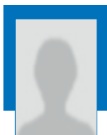
Shuguang Huang Pittsburgh, USA