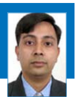
Wahajuddin Central Drug Re- search Institute, India