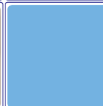
Pedram Gerami, Northwestern University, USA