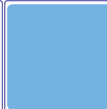
Delphine Kerob, Hopital Saint-Louis France