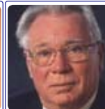
Derma Tronnier, GmbH & Co. KG, Germany