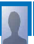
Rich Schultz Elmhurst College, USA