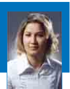
Kadiriye Department of Biology, Turkey