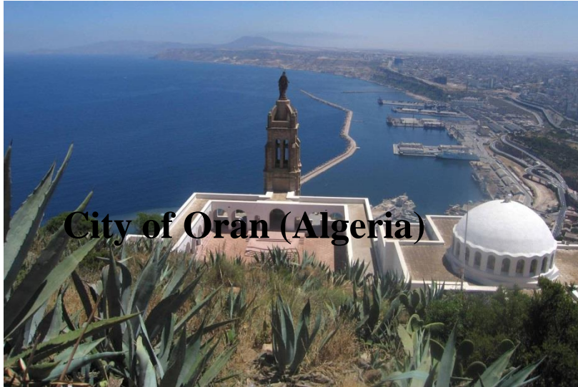
City of Oran (Algeria)