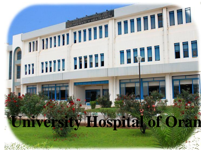
University Hospital of Oran (Algeria)