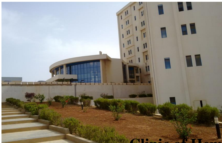
Clinic of Hematology and Cell Therapy