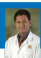
B Bin Abdullah Universiti Sains Malaysia, Malaysia