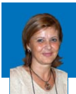
Elisabetta Tosti Villa Comunale, Naples, Italy