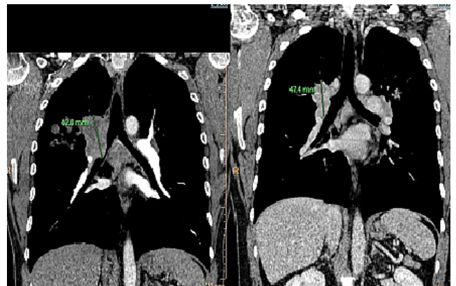
Figure 1: CT of the chest showing the tumour in the right upper lobe intruding the main bronchus. The CT scan was performed on the day of stenting

infiltrates were seen in the right upper lobe (Figure 1), which could indicate either metastasis or abscesses/infection. Regression of the tumour on the left side raised the possibility that the patient had two different primary tumours.