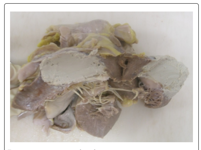
Figure 1: Narcotic material on the cyst.

Histological examination of the left ventricular myocardial wall revealed a fibrous-walled cyst with extensive calcification. Mixed inflammatory cells were seen adjacent to the advancing edge of the cyst wall including mast cells and multinucleated giant cells almost granulomatous in appearances in some fields. No cyst lining was identified. Amorphous granular debris was seen as cyst content but no cellular component was present (Figures 2 and 3).