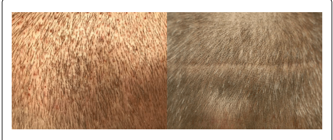
Figure 1 : Healing wounds - seven days after follicular unit extraction surgery showing wounds which are slightly red (left) and nine months after strip surgery showing where hair accentuates a 3 mm scar from a short hair style (right).

industry, changing both the public's demand for what has been promoted as a minimally invasive surgery, and the need for service providers' to fulfill the demands for this process. Many patients were unwilling to undergo a hair transplant when it appeared to be an invasive surgery producing a visible linear donor scar and varying degrees of post-operative pain. Many providers wanting to enter the business could not put together the complex infrastructure to deliver a quality strip-harvesting procedure requiring teams of highly skilled nurses and/or technicians to dissect the grafts. Stylish young men wanted to wear their hair short without a visible linear scar. Doctor's applied the term 'minimally invasive' as a catch all phrase to recruit new patients and misrepresented the FUE being a 'scar-less' surgery. As a result, FUE became a good alternative to traditional strip surgery. The fast recovery time with minimal, if any, significant post-operative pain and no significant restrictions on exercise, more than offset the social problems seen with the shaved donor area which had to be managed for the first week of so after an FUE procedure was performed. A return to full normal function matched the lifestyle of many patients as they could resume their exercise program without any restrictions after the FUE surgery (Figure 1).