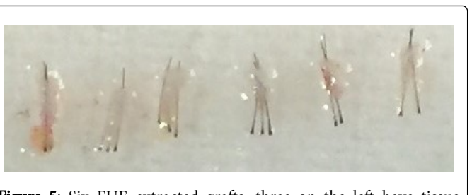
Figure 5: Six FUE extracted grafts, three on the left have tissue remaining around the follicles, while the three on the right show that the lower parts of the hair follicles are stripped of their capsular fat showing 'pants legs'.

Pants leg FUE extracted grafts: This is a term used to define a graft that is stripped of its distal follicular capsule and fat. The hairs separate from each other and may or may not have a thin layer of cell remnants from within the follicular capsule. This causes the distal hair follicles and bulbs to physically splay apart. Without sub-follicular fat or the capsule present, these grafts are difficult to place as they must be grasped at the bare bulb potentially producing considerable mechanical trauma during graft placement. These grafts also tend to dry out more easily as the protective fat and capsule is absent. Pants Leg grafts are common with FUE, particularly when there is a low elastin content in the collagen. In the paper by Rassman et al. [2], less than perfect grafts were more likely as the presence of elastin in the collagen decreased and more easily traumatized. The varying degrees of inelastic collagen would explain the appearance of Pants Leg. The various instruments discussed above may see a different frequency of Pants Legs, but there is presently no information on this in the literature. Logically, those grafts that have Pants Legs, which are subject to more damage from drying and the mechanical impact from placing them, may produce decreased growth and possibly a lesser quality of each hair in that particular FU (Figure 5).