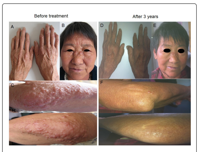
Figure 1: (A) Nodular lesions over fingers with flexion deformitites of DIP. (B) Papulonodular in the paranasal region show "leonine faces". (C) Nodules on elbow, giving a cobblestone appearance. (D, E, F) After 3 years of receiving prednisone and CYC therapies

resolved and the pain of joints were relieved (Figure 1D, 1E). The ESR and CRP became normal. Prednisone was gradually tapered to 5mg once daily and CYC 0.2 g/m<sup>2</sup> continued once weekly. After 1 year treatment, she stopped all therapy on her own and symptoms did not relapse in subsequently 2 years follow-up. However, repeat radiography of the hands revealed progression of bony erosions (Figure 2B). Then the patient is taking prednisone 5mg once daily and CYC 0.2 g/m<sup>2</sup> once weekly.