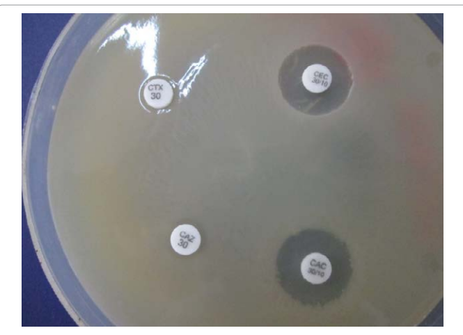
Figure 1: Phenotypic Confirmatory Disc Diffusion Test (PCDDT): Ceftazidime and Cefotaxime showing an increase in zone diameter of >5 mm with the addition of Clavulanic acid, indicative of ESBL production in a Klebsiella pneumoniae isolate.

showed presence of SHV gene with bla_{SHV} primers. Twenty isolates (20%) had both bla_{TEM} and bla_{SHV} gene (Figure 3 and Table 3)