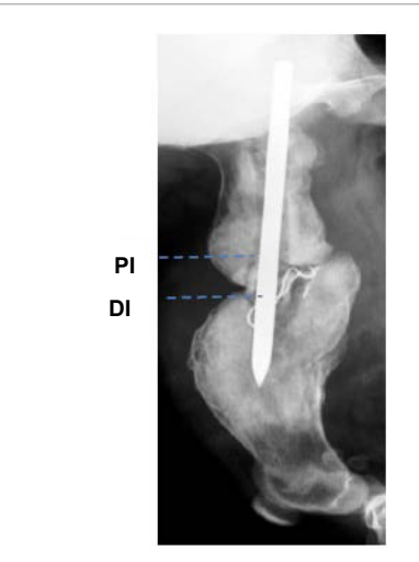
Figure 2: The radiography at75 days shows, complete consolidation of callus on the 2 interfaces, the graft is still in place and does not have any modification noted (case N^0 1 graft covert with propolis ).

both interfaces, unlike the control group where the callus moved to a limit not exceeding the limit of the graft Figure 3. Osteoclasts, supplied by the vasculature, provide the resorption of necrotic bone. This step of the graft incorporation is the most important first eight (08) weeks of its establishment. The porosity increases the resorption of the graft decreases and therefore its mechanical strength. That is why it is estimated that the critical period of a strength point of view lies between the (06th) and the sixth week (06th) six months after transplantation.