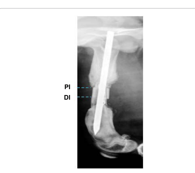
Figure 3: Radiograpy at 30 days shows the progress of the callus of the 2 interfaces, the graft is still in place and kept the integrity of its cordical (case N^0 3 graft without propolis).