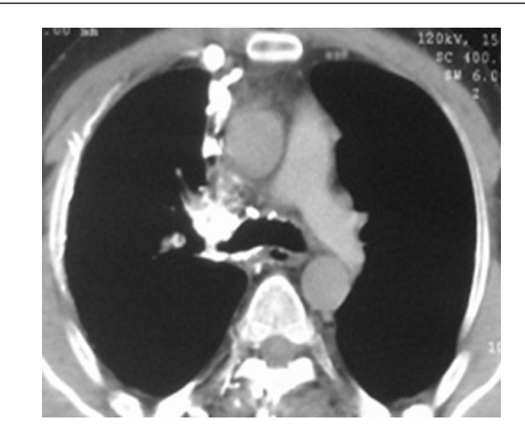
Figure 4: Thrombosis of the superior vena cava