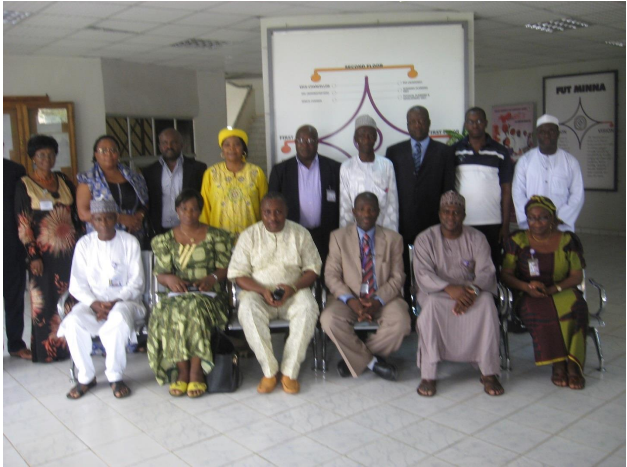
Across section of NSBMB EXCO with the Principal officers of FUT Minna