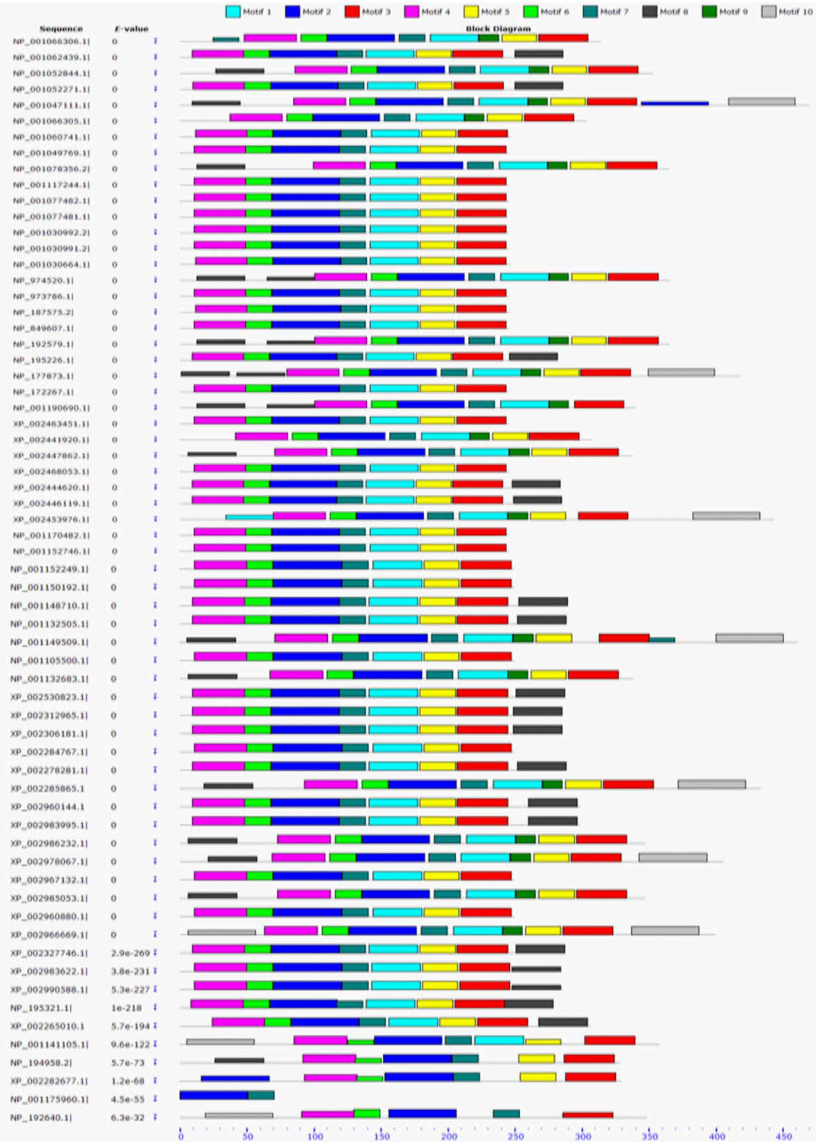
Figure 3: Block Diagram of Multilevel consensus sequences for the MEME defined motifs of APX proteins: Ten motifs were obtained by MEME software. Different motifs are indicated by different filled boxes with numbers 1 to 10.