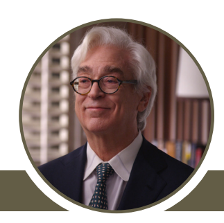
Russell Jaffe Health Studies Collegium, USA