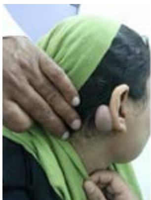
Figure 1: The patient with right auricular mass.

Introduction: Schwannomas are slowly growing benign tumour of neuro-ectodermal origin. Schwannomas are well known to arise from schwann cell of the branches of peripheral, cranial or autonomic nerves. They are usually presented as a painless solitary swelling. They are affecting the head and neck in a 25-45%, where the vestibular schwannoma is the commonest. The presentation of head and neck schwannomas depends on their location. Auricle is a rare site of affection by schwannoma (1). The first case of external ear schwannoma was reported in 1977 (2). When we were reviewing the literatures, only five cases of auricular schwannomas were reported in the world (1-5). In the present article we describe a further case of auricular schwannoma.