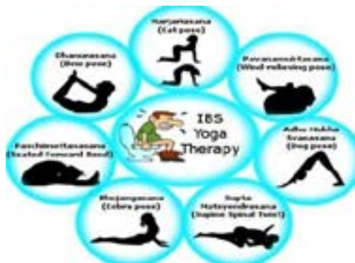
Figure 1: Multiple Yoga postures that can be performed for symptomatic relief in Irritable Bowel Syndrome

Statement of the Problem: Functional GI disorders are increasingly researched to have a strong rooted relationship with underlying behavioral abnormalities that can be effectively addressed with Yoga in addition to standard medical care. Yoga is an ancient Indian discipline that entails practices to connect mental, spiritual and physical health to stimulate one's mind and body to become self aware and observant. Over centuries, this practice has revealed itself to offer therapeutic effects on multiple organ systems by virtue of a deeper connection between mental and physical health. Numerous gastrointestinal disorders have been discovered to have an underlying behavioral etiology. These primarily include IBS (Irritable Bowel Syndrome) (figure 1), FAPD (Functional Abdominal Pain Disorders) and IBD (Inflammatory Bowel Disease). This article will aim to review gastrointestinal disorders with an associated behavioral or mental preponderance that have been studied to benefit from the healing and therapeutic effects of yoga.