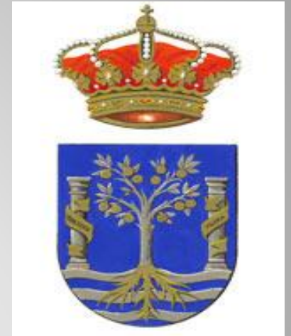
University of Cádiz