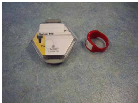
Figure 1: A Finger badge dosimeter (right), and a whole body waist badge dosimeter (left) were used for measurements of radiation exposure and used serially amongst surgeons performing procedures. Separate badges were used for radiology staff and for pathology staff performing wider excision and/or sentinel node diagnostic procedures.

was used for all studies and 40 MBq was injected in 4 divided doses either intradermally around the primary melanoma excision site, or peri-tumourally around the primary breast cancer. The pre-operative lymphoscintigram was performed for each case prior to Patent Blue (Guerbet, Faulding, Adelaide) dye injection, according to the same protocol as that used by our group as part of the Multicenter Selective Lymphadenectomy Trial (MSLT-I) studies [2,3] and for breast cancer [4]. All patients were injected with the radiopharmaceutical on the morning of surgery and proceeded to the operating theatre later that day, within 3-5 hours of receiving the radiopharmaceutical. Personal dosimeters were worn during the operative period from the time of commencement to completion of the procedure. Measurements at the non-dominant index finger were performed using a finger badge dosimeter (Figure 1 - right), and whole body doses were measured using a waist badge (Figure 1 - left). Sterility was preserved by careful washing of the finger-badge in antiseptic solution, and then placing it between two layers of sterile gloves using a double gloving technique (Figure 2). The pathway of the sentinel node procedure was identified from initial entry into the operating theatre, transport of the specimen from theatre to specimen radiology (breast) and to the pathology department (melanoma and breast) and steps at each stage were measured for radiation exposure levels (Figure 3).