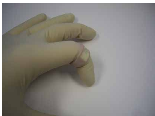
Figure 2: The finger-badge was carefully washed in antiseptic solution, and then placed between two layers of sterile gloves and worn on the non-dominant index finger, using a double gloving technique.