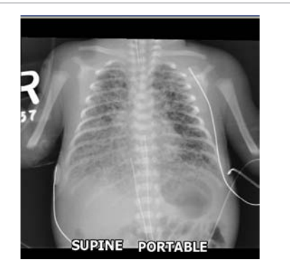
Figure 1: Chest x-ray of the infant at 2 days of age, showing bilateral severe PIE and atelectasis of the right middle and lower lung lobes.

Although invasive mechanical ventilation is frequently used to treat respiratory insufficiency or apnea in very low birth weight infants (VLBW, birth weight less than 1500 g), it can be associated with serious complications including pulmonary interstitial emphysema (PIE). Even during minimal pressure ventilation [2], PIE may complicate