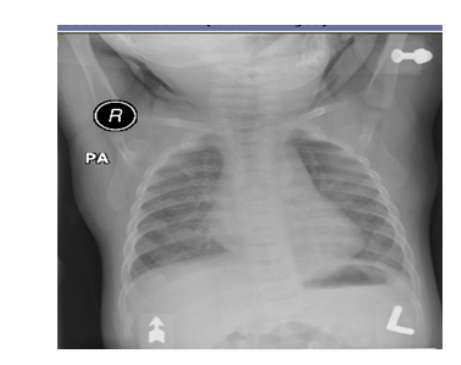
Figure 4: Chest x-ray of the infant 10 days after NP-SM-HFOV, showing the disappearance of PIE.

Figure 3: The relation of mean daily needed oxygen therapy to the days of nasal high-frequency ventilation.