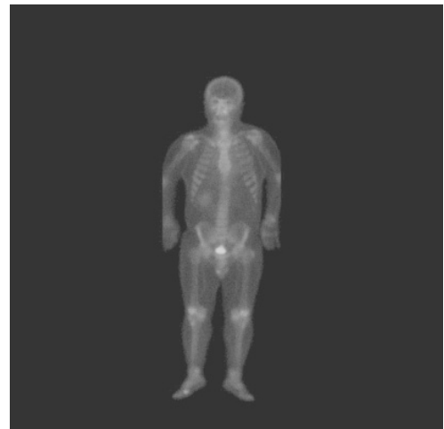
Figure 1: Whole body bone scan.

A 55-year old man came to our Institution, Fondazione Pascale Hospital, for urinary oncological counseling. He was of proportionate