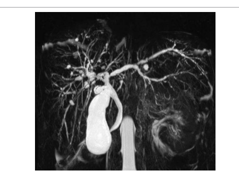
Figure 1: Maximum intensity projection image showing diffuse dilatation and irregularity of the intrahepatic ducts in the left and right liver lobe, with multiple marked saccular dilatation and segmental narrowing; mild segmental dilatation of the common hepatic duct is also visible. No intraluminal filling defects are present.

A 20-year-old woman presented with epigastric pain and jaundice. Physical examination revealed mild icteric sclera and normal liver and spleen. Biochemical tests were as follows: normal blood count, alanine aminotransferase 191 U/l, gamma-glutamyltransferase 149 U/l, alkaline phosphatase 252 U/l, total bilirubin 5.6 mg/dl (5.0 conjugated), normal renal function tests. Viral markers for hepatitis A, B, C, Epstein Barr, HIV, CMV were negative, and the immunological profile was normal. She reported occasional alcohol consumption and sporadic cigarette smoking habits. She was not taking medication, but reported an assumption of Levonorgestrel (750 mcg) after a sexual intercourse 2 weeks before. Abdominal ultrasound showed dilatation of intrahepatic biliary ducts; a nuclear magnetic resonance cholangiography (MRC) showed enlarged liver with focal inflammatory areas, splenomegaly, intrahepatic biliary tree enlargement with irregular profiles and marked stenosis alternated to dilatations and cystis; the common hepatic duct was mild dilated without stenosis, compatible with primary sclerosing cholangitis (PSC) (Figure 1). An inflammatory bowel disease was ruled out by a colonoscopy. The patient was treated with standard dose of ursodeoxycholic acid, followed by a gradual normalization of liver