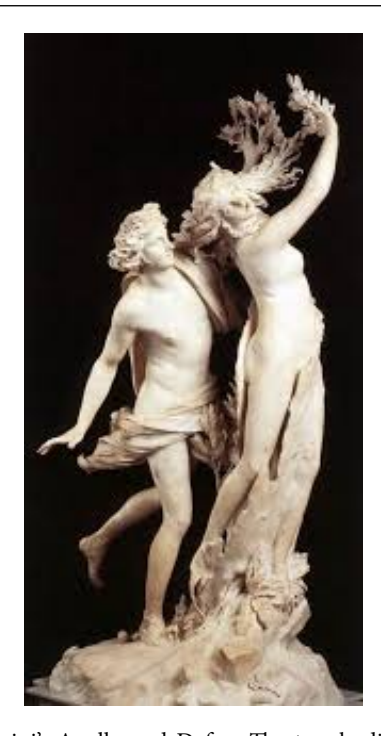
Figure 4: Bernini's Apollo and Dafne: The two bodies seem to be moving from the plinth!

It is obvious that, under the "quantitative" and therefore "mechanic" point of view, even "numbers" and "geometrical shapes" cannot at all be still considered as "perfect" and "imperfect", like they were according to Aristotle and all the subsequent scientists till Galileo Galilei: They become simply the only means to understand both the greatest and the littlest "machines", i.e. the universe and all the phenomena that surround us. Suffice it to read another of Galilei's passages: "As for me, I never read the chronicles and the particular nobilities of the geometrical figures and by consequence I don't know which of them are more or less noble or more or less perfect. However