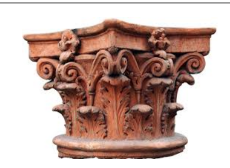
Figure 3: The really "moving" shape of a Corinthian capital.

scientists, Archimedes (287-212 BC), discovered the "quantitative" "laws of the lever" and the famous and no less "quantitative" "Archimedes principle" and "specific weight", fourth that the title itself of Borelli's fundamental treatise is just as said above; De motu animalium (On the movement of animals), in which the author explains all the "movements" of all the animals, man included by "mathematical means".