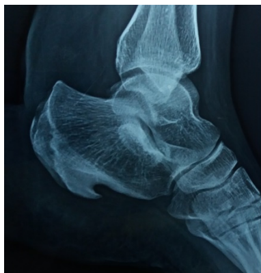
Figure 1: Preoperative X-ray.

The post-operative follow-up: The patients discharged on the same day of the operation in just a crepe bandage. Each patient was instructed for partial weight bearing for 2 weeks after the surgery and ambulates afterward in a silicon heel for about 4 weeks. The patients underwent follow-up program for evaluating the clinical results in terms of pain, activity level and patient satisfaction.