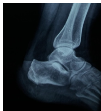
Figure 4: After resection of calcaneal spur.