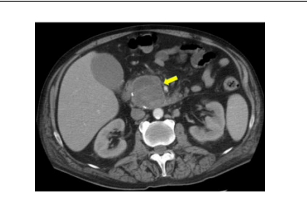
Figure 1: Abdominal CT (taken at day 8 from admission) during acute exacerbation of pancreatitis. Note the roundish formation of 55 mm in diameter in the head of the pancreas (arrows) with necrosis and colliquation.

respiratory systems was unrelevant and vital signs were normal. Laboratory tests showed a remarkable leukocytosis (WBC: 18,000 / mmc, neutrophilis 91%) and a prominent increase of inflammatory indexes (C-reactive Protein: 17.3 g/dL, n.v. <0.80). An autoimmunity profile (ANA, ENA, anti-DNA, rheumatoid factor, anti-CCP, ANCA, C3 and C4, streptozyme test) and oncomarkers were all negative. Also, the patient complained of severe pain involving bilateral ankles, knees, shoulders and elbows joints associated with evident swelling. X-Ray evaluation dis not show any articular / bone changes, while the arthrocentesis demonstrated a yellowish synovial fluid which was negative for bacteria or other infections and therefore excluding a septic arthritis. Systemic (methylprednisolone, 60 mg daily) and local (intrarticular) steroid therapy resulted in a modest improvement of pain.