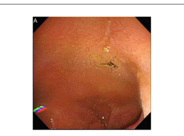
Figure 1: An insect was found in the Duodenal bulb.

A 55-year-old male patient had peptic ulcer history with regular follow-up. This time, an upper endoscopy was performed due to abdominal discomfort. Interestingly, an insect was found in the duodenal bulb (Figure 1), and on close-up view, it was consistent with the structure of a mosquito (Figure 2). After the literature review, it was found that few cases of finding insects in the gastrointestinal (GI) tract have been described. Cockroaches [1], ants [2,3] and bees [4] have been reported; however, our case is the first reporting any insect in the duodenum and the first reporting a mosquito in the GI tract. The patient lived by a fish farm with a humid environment for mosquitoes to breed and most likely swallowed the mosquito unintentionally. Mosquitoes are more fragile than other reported insects and easily damaged in the swallowing process. Consequently, it is rare to see a complete mosquito within the GI tract.