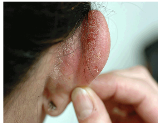
Figure 1: Patient's ear after having dyed her hair 2 weeks prior and put on oral corticosteroids one week before the picture

Patch testing was performed with PPD (1%, pet) and 6 chemically related hair dye substances (see Table 1), and hydrokinon. As test chamber the Finn chamber (Smart Practice, Phoenix, Arizona, USA, 8 mm diameter, 20 mg petrolatum [4,5] was used, mounted on Scanpor tape (Norgeplaster A/s, Vennessla, Norway), with occlusion for 48 hours. The patch tests were read according to the ICDRG [6] on day 3.