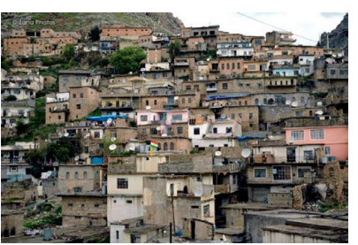
Figure 8: Traditional houses in Iraqi Kurdistan (KRG Achieve).