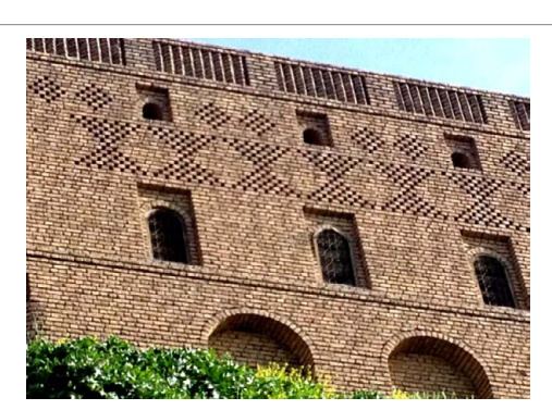
Figure 13: Vocabularies of ancient Erbil castle.

For nations with limited recognition like the Kurds who have struggled towards recognition, using most amicable and non-amicable ways, and have not reached its aim yet, it is possible to view the lack of Kurdish identity in architecture as a relative factor, which potentially has affected such phenomena. Since the relationship between nation image and national identity is longitudinal, an abstraction of both