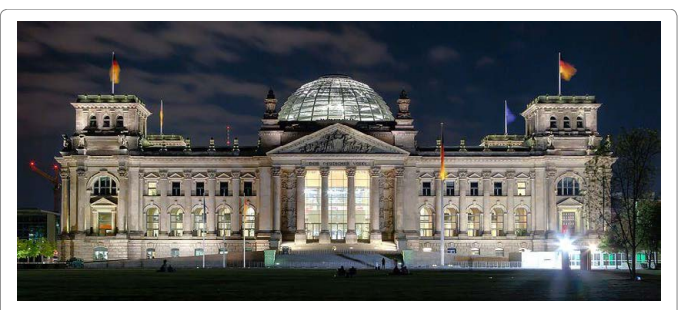
Figure 4: Reichstag Building by Architect Paul Wallot, 1919 & Norman Foster 1999 in Berlin, Germany.

failed to fully explore its origin in architecture in order to legitimize their national identity and visual image. These historical sites were formulated in different political phases according to the addition of successive regions that had been under distinct occupations for centuries. Such a cultural heterogeneity reveals additional complexity in Kurdish history. "Sharing a common history does not mean that people have shared a common experience of that history" (McNiven, Russell 2005) as cited [44].