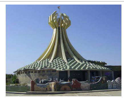
Figure 9: Halabja Monument in Halabja.

However, on March 16, 2006, the memorial was set on fire,