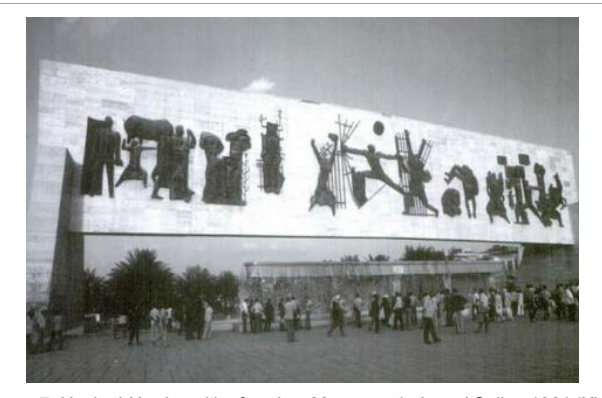
Figure 7: Nasb al-Hurriyya (the freedom Monument), Jewed Salim, 1961 (Khalil 199).

One of the important decisions by the central authority since 1930's was reforming and developing the local architecture by adopting international architecture. Yet, the applied plans and architectural solutions had ignored several important issues including that Iraq is