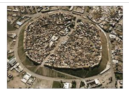
Figure 5: Erbil Citadel.

Amadiya is a town north west of Iraqi Kurdistan Region. It is about 78 Km north east of Dohuk City. On the Administrative level, Amadiya is a district encompassing five sub districts. Amadiya exists on a huge rocky hill and is about 1640 m above sea level and its area is about 1500 m \times 650 m. It is a fort town that goes more than 3000 years back into the history. The town was at some times in the hands of the Assyrians. It became later a main city of the Median State and afterwards the Bahdinan Emirate for six centuries. The town was entered by the Muslims in the 7th century. The town has two ancient gates which are still used. The city has only one access for transportation; originally it has two accesses the second is used by pedestrians now. There are at least six historical remains in the town are poorly reserved [46].