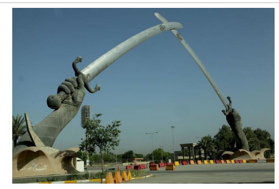
Figure 3: Victory Arch in by 1989, in Bagdad the symbol of victory.

Although some metaphors can be considered analogies, because they share rational information, the two are different as the authors of the Analogical Mind are careful to point out, "metaphors can be based on common object attributes" while analogies cannot [41].