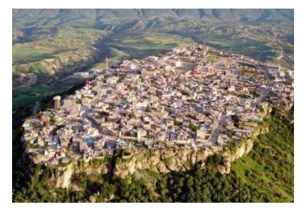
Figure 6: Town of Amadiya.

Currently, the ruins of historical sites in Southern Kurdistan function as part of the national evolution under the topic of tourism. In fact, a clear distinction of architectural identity based on Kurdish vocabularies can hardly be perceived since it is fused with the occupied patterns. Although the ruins of these historical sites are of great importance to historians, archaeologists and anthropologists to identify and preserve them as areas of outstanding value to humanity, the question that remains is the role architectural ruins in southern Kurdistan play in forming Kurdish architectural identity. geographically the historical architectural sites are distant from each other those that belong to the same political series share the same political myths and aesthetic characteristics, the aim behind the method is to find Kurdish architectural details (vocabularies) based on the relationship between the morphological structure of the archaeological sites and its political structure [47].