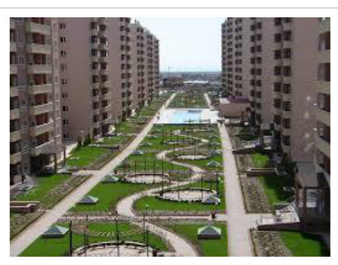
Figure 17: Zakaria Luxus apartment.