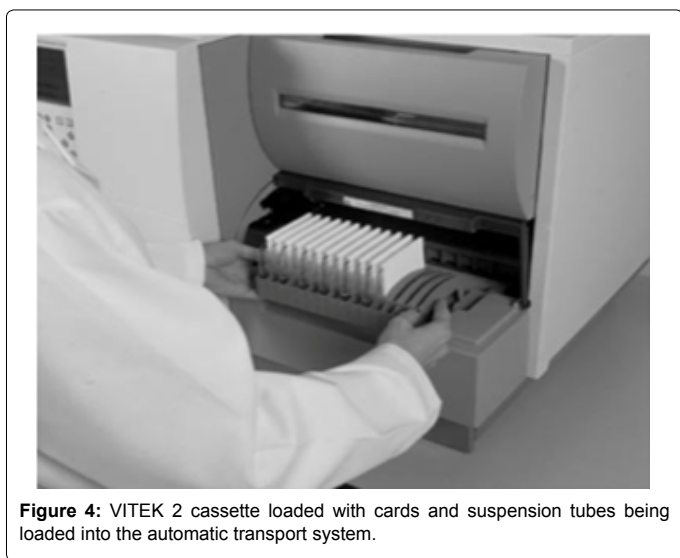
Figure 4: VITEK 2 cassette loaded with cards and suspension tubes being loaded into the automatic transport system.

15 minutes to measure either turbidity or colored products of substrate metabolism. In addition, a special algorithm is used to eliminate false readings due to small bubbles that may be present.