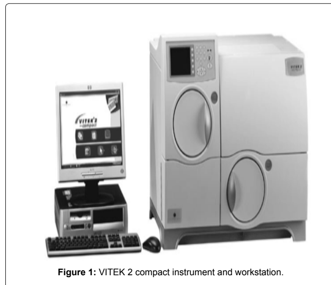
Figure 1: VITEK 2 compact instrument and workstation.

media, culture age, incubation conditions, and inoculum turbidity (VITEK 2).