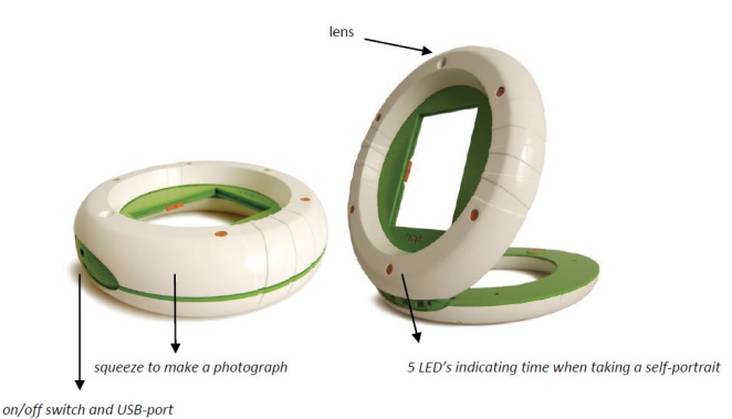
Figure 3. The Scope camera in more details.