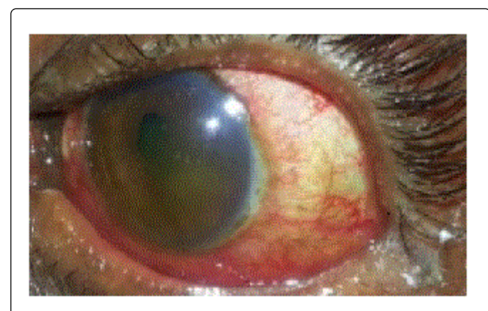
Figure 1: Left eye showing haziness of the temporal half of cornea due to exudative membrane over the temporal iris.

An ophthalmology reference was sent for red eye one day after admission. On examination patient had altered sensorium, visual acuity could not be assessed. He had ciliary congestion in both eyes. The right eye (RE) showed exudative reaction involving superotemporal quadrant of the iris and small non-reacting pupils. In the left eye (LE) cornea was hazy with exudative membrane involving temporal half of the iris (Figure 1). Pupils were small and not reacting to light. Fundus could not be examined. Patient was started on mydriatics and topical steroids. Pupils were dilated after one day to reveal posterior synechiae. Posterior segment showed significant vitreous haze obscuring the retinal details.