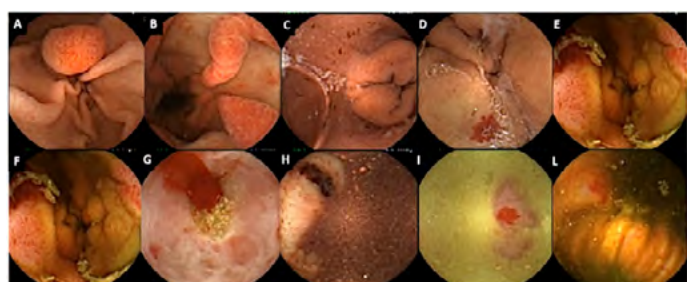
Figure 2: Lesions missed at endoscopy: A gastric adenoma; B gastropathy; C acute erosive gastritis; D duodenal angiodysplasia; E duodenal adenocarcinoma; F cecal carcinoma; G cecal lymphoma; H, I, L colonic angiodysplasia.

The types of lesions identified in the gastrointestinal tract on CE are shown in (Figure 2).