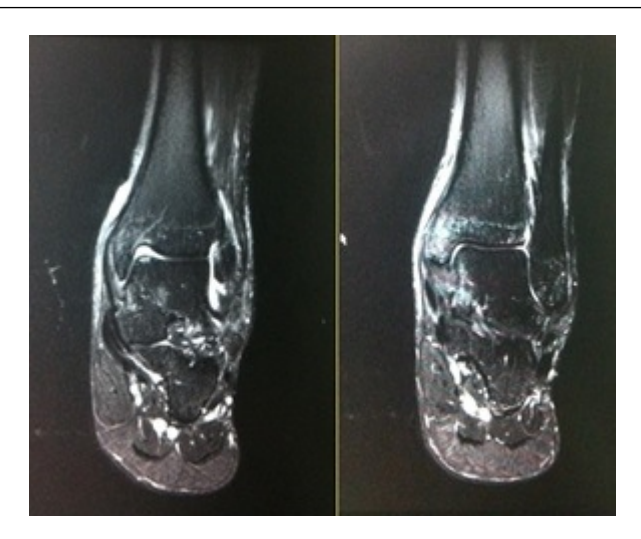
Figure 6: MRI images of left ankle, coronal view (2ndcase) show subchondral bone edema at medial malleolus with gr.IV cartilage lesion at medial talar dome.