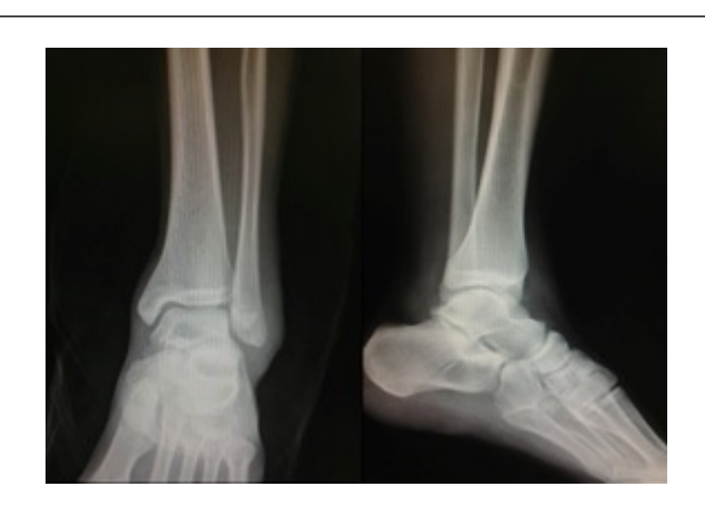
Figure 5: AP and Lateral radiographs after closed reduction (2nd case).

After reduction his ankle was immobilized for 3 weeks in a short leg slab followed by wearing walking boots with progressive weight bearing until full weight bearing was reached.