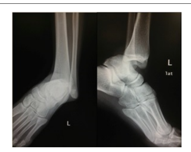
Figure 4: Initial radiographs of left ankle, AP and lateral views (2nd case).

Initial X-ray images showed posteromedial dislocation of left ankle with no malleolar fracture (Figure 4).