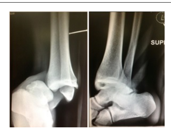
Figure 1: Initial AP and lateral radiographs of the left ankle (1st case).

Initial radiographs showed posteromedial dislocation of the tibiotalar joint without any fracture (Figure 1).