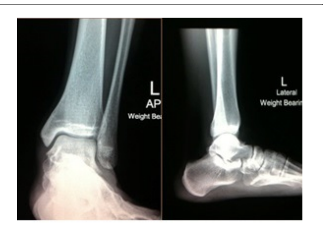
Figure 7: Three years after injury, radiography show tiny osteophyte at anterior neck of talus.