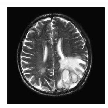
Figure 1 : MRI shows a double-cystic lesion in the left parietal lobe, which demonstrated hyperintensity on T2-weighted images with evident perilesional edema.

An initial diagnosis of cerebral abscess was made. Two days after admission a left parietal craniotomy was performed. Intraoperatively, we found that the skull and dura mater under the scalp sinus were all