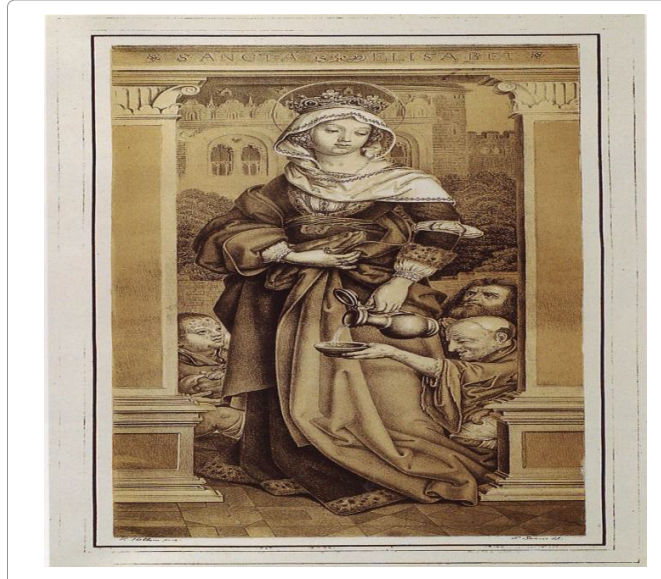
Figure 1: A chalk lithograph from the 16th century of Elisabeth personally helping the poor.

Of course literature focused on the topic "Saint Elisabeth" too. The book shown in Figure 3 was written by Alban Stolz was edited 50 times