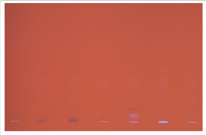
Figure 2: HPTLC finger print of herbs used in Keshraksha oil-366 nm.