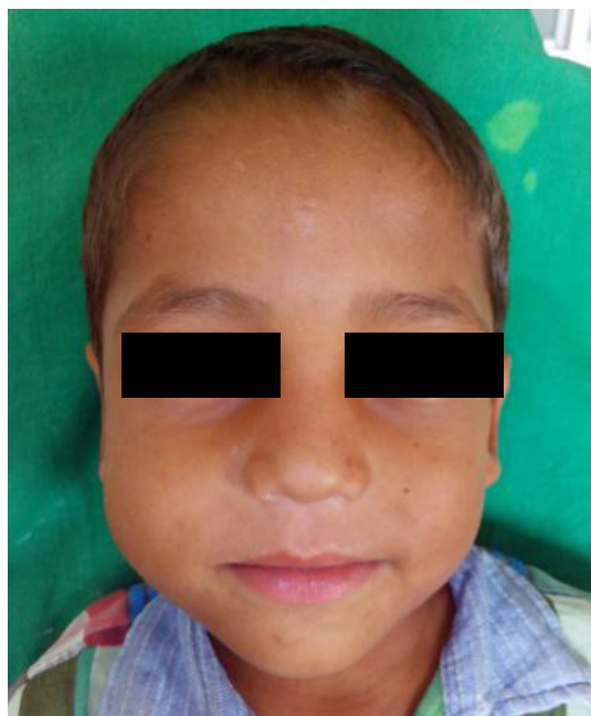
Figure 1: A diffuse extra-oral swelling in the middle and lower one third of face.