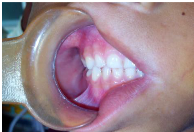
Figure 2: Introral examination reveals a prominent mass on clenching.