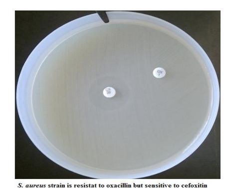
Figure 1: CxDD and OxDD test for MRSA

PPV-Positive predictive value, NPV- Negative predictive value, Ox DD- Oxacilline disc diffusion, CxDD-Cefoxitin disc diffusion, OSA- Oxacillin screen agar.