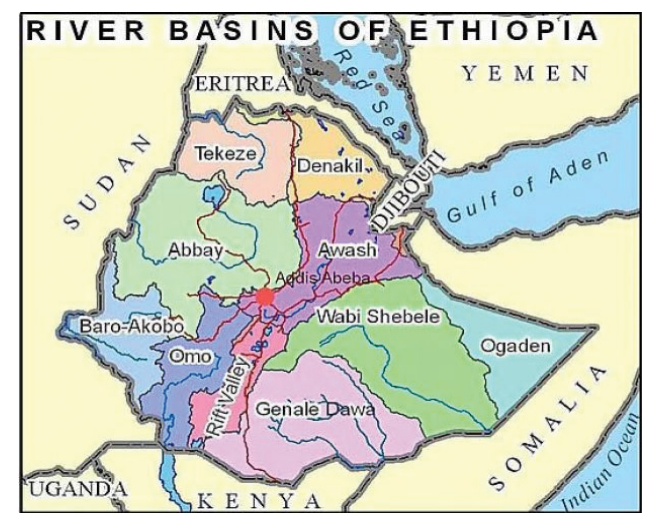
Figure 1: Location map of major river in Ethiopia.