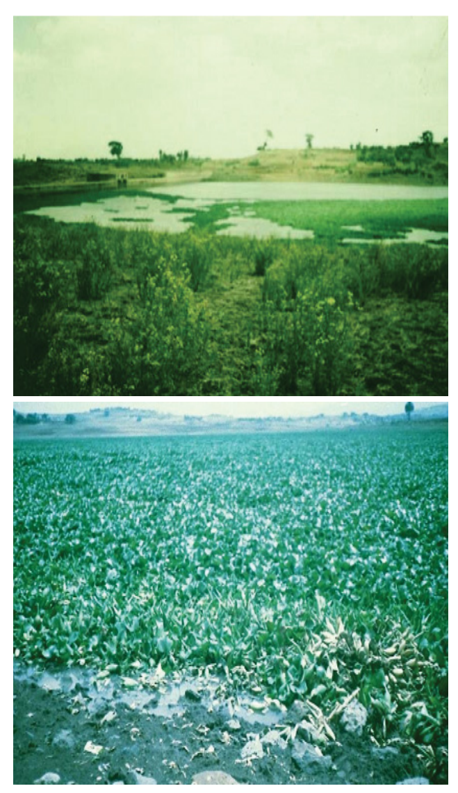
Figure 9: Aba Samuel Lake covered by water hyacinth (left) and Eutrophication in Aba Samuel Lake (right).

Heavy metals has a capacity to accumulate in the food web especially in fishes and vegetables and threat living organisms [49]. The number of researches has so far been conducted in vegetable grown in polluted soil and irrigated by waste water in Addis Ababa and the results shows that the vegetables have a capacity to accumulate large concentration of heavy metals above the recommended maximum limit [32,50,51]. Since the 1940s, a variety of vegetables have been produced within and around the city, mainly using water from the Akaki River [52]. In Akaki river around 390 hectares of land irrigates vegetables such as potatoes which have some toxic elements such as zinc, nickel, mercury, copper, cadmium and chromium, as does red beet and onions containing chromium [15]. For a long time, it has been known that intake of food