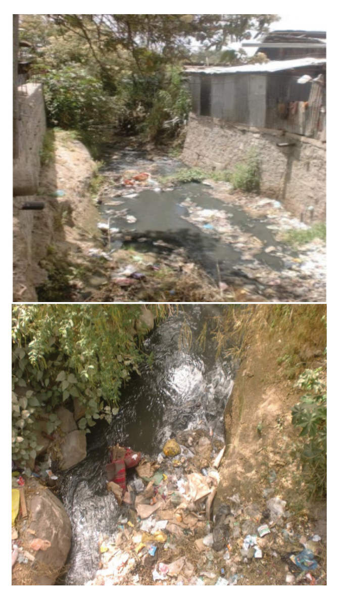
Figure 8: Dumped solid waste and pollution in Finicha river.

Industries are contributing to the loss of the well-being of society and are one of the causes for society's health problems. In principle,