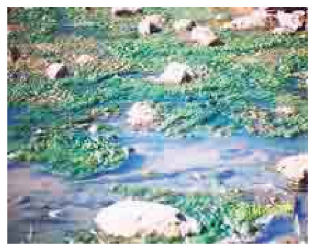
Figure 6: Organic pollution in Kebena river.