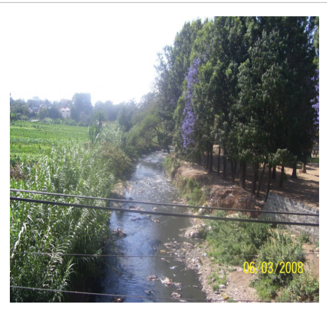
Figure 7: Vegetation near the Bulbula river bank.

Table 6: Bulbula river bank water quality at different zone.