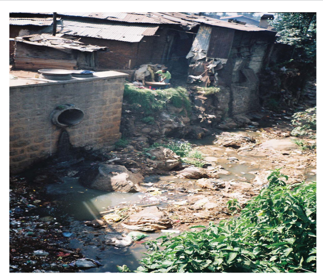
Figure 3: People discharge toilet and domestic waste water to Little Akaki river.

Hydrological investigation carried out in the Akaki area have shown that out of the total amount of water supplied to Addis Ababa