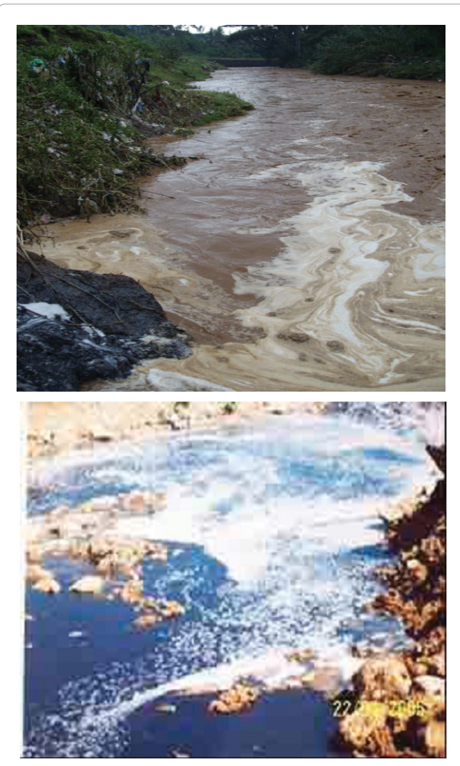
Figure 5: Akaki river pollution (Source: Alemayehu et al. [3]).