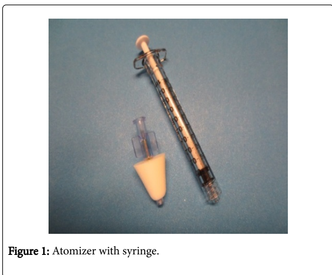
Figure 1: Atomizer with syringe.

Studies looking at atomized drugs intranasal show that drug particles are rapidly absorbed into the blood stream with rates comparable to those seen with intravenous administration [10,15]. Commercially available atomized pumps which are attached to a pre-loaded syringe are capable of atomizing drug particles to 2-10 micrometers and can distribute these particles across a broad area of mucosa (Figure 1). These atomized pumps offer a needleless delivery system that is safe and effective which allows for controlled administration of drugs [13,15].