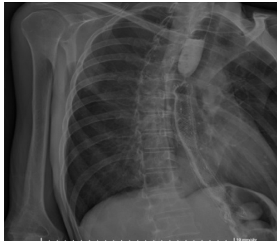
Figure 2: Insertion of the fourth prosthesis with an endoscopic vision.

The results coincide with that of proposed by Kujawski et al. in with there was a minimum of complications, chest pain predominated in patients with lesions in the middle esophagus [7,8].