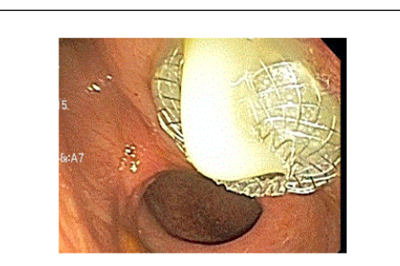
Figure 3: Drainage of milky fluid from pancreatic pseudocyst through hot axios stent.