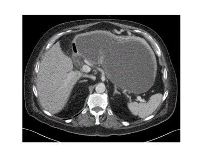
Figure 1: CT scan showing large pancreatic pseudocyst.

analysis was negative for malignancy but culture grew Candida Albicans and he was treated with Fluconazole. Post procedure CT imaging confirmed the proper placement of the stent with cyst resolution (Figure 4). Patient improved clinically over the next few days with complete resolution of jaundice and liver function test completely normalized after 5 weeks. Patient remained asymptomatic and Hot AXIOS stent was removed after 8 weeks.