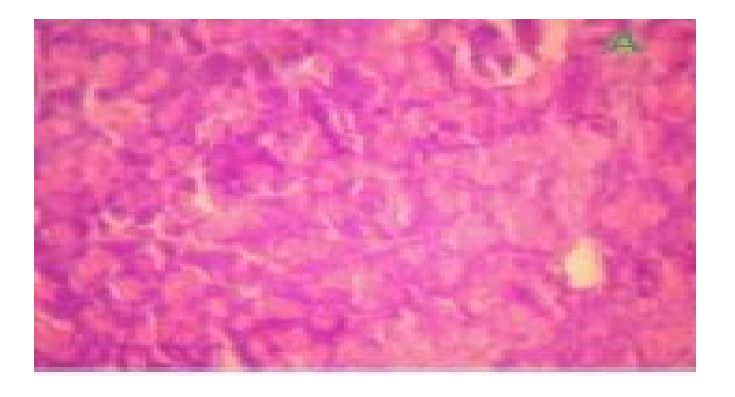
Fig 3: Histopathological reports shows that in different groups as follows A) Normal rats show normal islets. B) Alloxan (120 mg/ kg) induced diabetic rats shows abnormal. C) H, Z 250 mg/kg treated rats. The structure of pancreas is partially effaced. D) H, Z.500mg/kg treated rats. The islets are normal. E) Metformine (10mg/kg) treated rats the islets are normal.

Fig2. Blood glucose level (mg/dl) in normal control, Diabetic control and treated Homalium Zeylanicum groups(Data was expressed Mean \pm SD (n=6) values were significant when *p<0.05, **p<0.01, ***p<0.001, compared between diabetic control and treated groups).