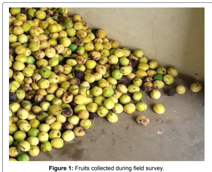
Figure 1: Fruits collected during field survey.