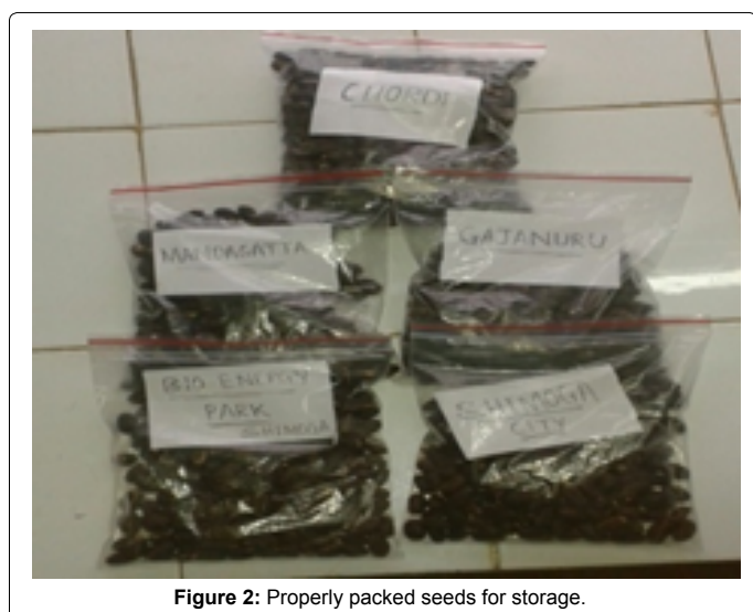
Figure 2: Properly packed seeds for storage.