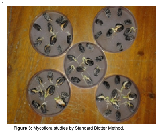
Figure 3: Mycoflora studies by Standard Blotter Method.