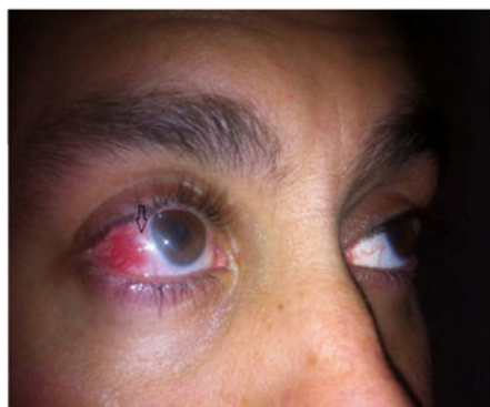
Figure 1: Figure showing dilated, inflamed scleral vasculature and a prominent nodule (black arrow) [24].

It is one of the commonest manifestation in relation to the eye secondary to inflammatory bowel disease with the incidence of 29% [25], there is a relation between episcleritis and Crohn's disease in which episcleritis indicates the CD activity [23].