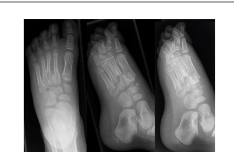
Figure 1: X-ray at admission.

operation. In addition, immobilisation with short non-walking leg cast was achieved.