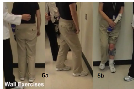
Figure 5: The shoe should be modified by increasing its lateral border as seen.