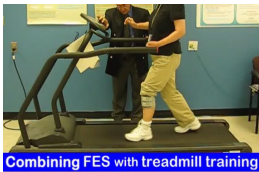
Figure 4: It presents a patient 2-years post-stroke, learning to walk on a treadmill without hand support at a patient-driven ability to increase speed.

vs. FES independent to determine improvement in performing the reaching tasks. In cases where stimulating the wrist/finger extensors results in wrist extension but concurrent finger flexion and inability to open the hand, a custom hand plate can be made out of readily available thermoplastic material (Figure 3). The hand plate assures better fingers position while strengthening the wrist/finger extensors and stretching the wrist/finger flexors. Progress is documented when opening the hand can be achieved with FES but without the hand plate. Finally, reaching training can be done in different positions; these include supine and standing and should include both uni and bimanual reaching, keeping in mind that the paretic upper extremity may be restored functionally as an assistive hand only in the majority of stroke survivors.