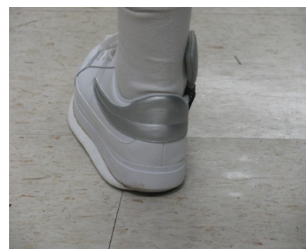
Figure 6: Lateral to medial Posting indication: if spasticity suddenly Increase during swing.