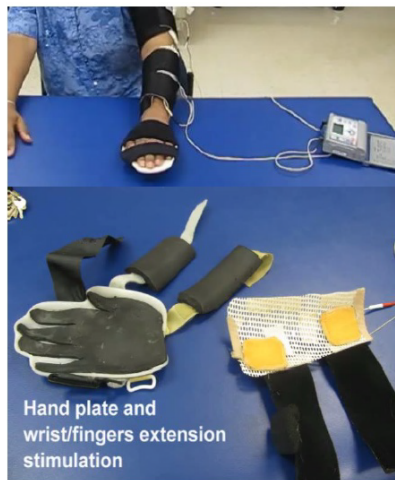
Figure 3: In the near future these FES will become wireless, wearable systems