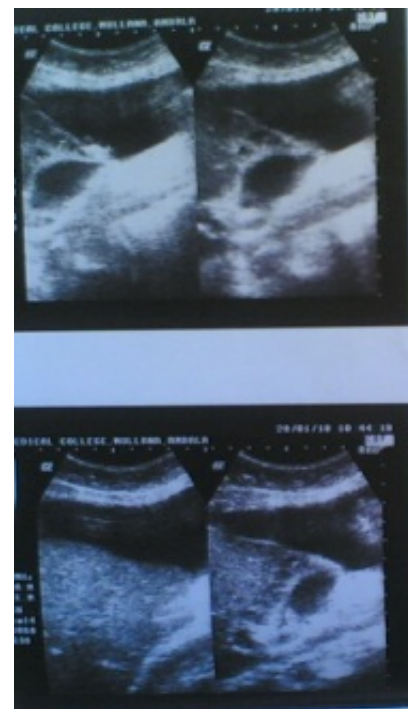
Figure 1: Cholelithiasis with empyema of gall bladder.

There was large 2 cm defect in the left anterior wall of gall bladder with formation of large abscess in adjacent liver. On USG diagnosis